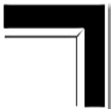
Mitred Corner join, to IP66. (Corners pushed together; no bonding)