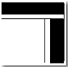
Straight or Butted joins, to IP55. (Corners pushed together; no bonding)